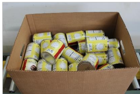
Image 1. Fully packed food drive box. Box dimensions: 19x13x11. No more than 50 pounds.