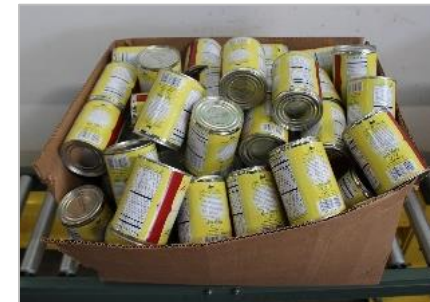
Image 2. The box is filled past the folding flaps, and is ripped, making it likely to break when lifted, and causing the cans to fall out.